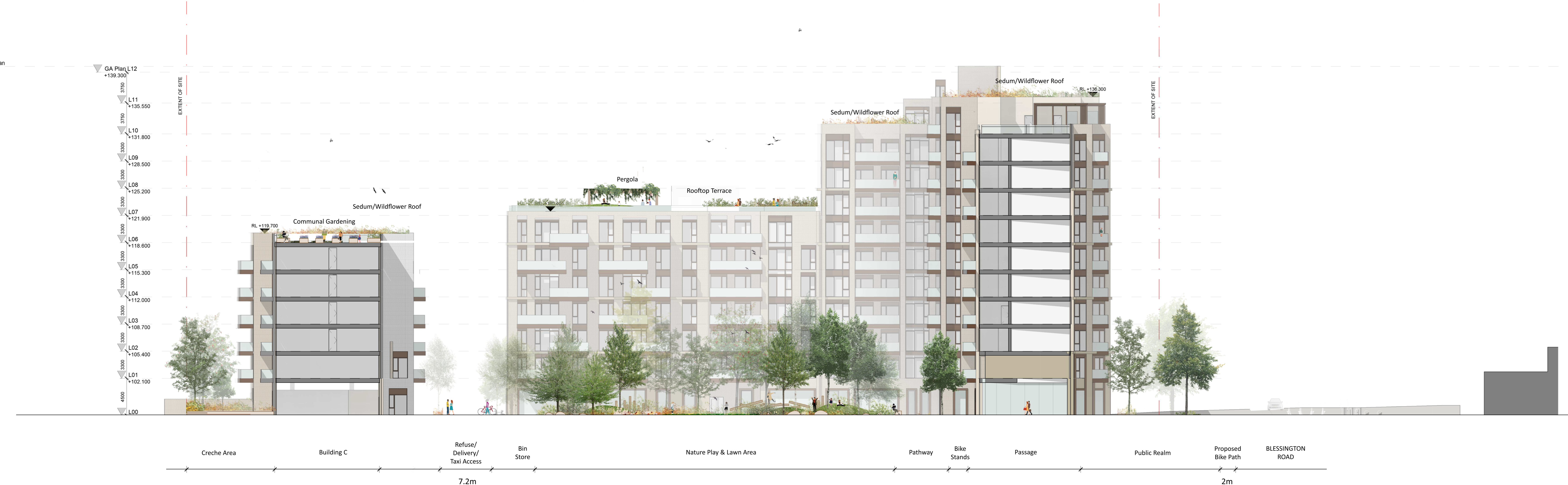
2 PLAZA ELEVATION SOUTH 1 : 200