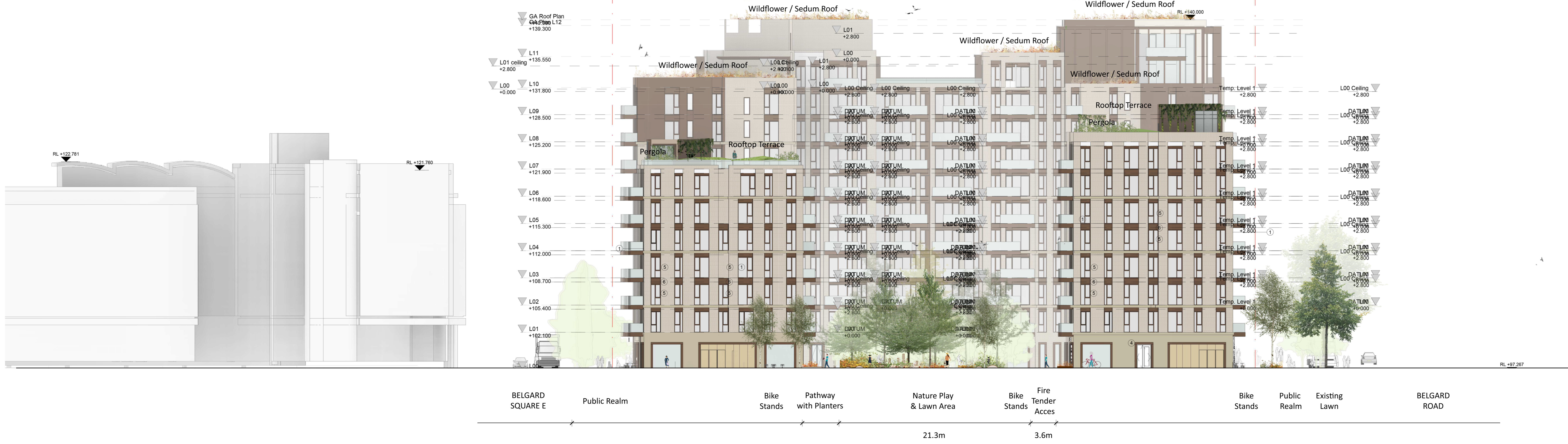
1 PLAZA ELEVATION WEST 1 : 200